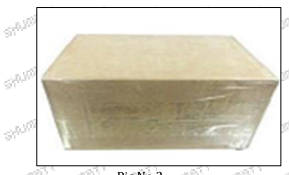
Pic No.2 Domestic express packaging: Wrapped by Transparent tape

Minors are prohibited from using transparent tape, yellow tape, black wrapping protective film, and white wrapping protective film to avoid personal injury.